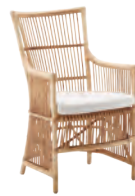
DAVINCI CHAIR - 1005U W56 D54 H99 SH51 AH68