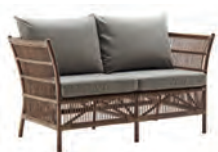
DONATELLO 2-SEATER - 2086A L145 D72 H75 SH46