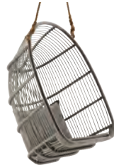
RENOIR SWING - 3080T W75 D68 H113