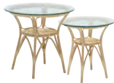
CAFÉ TABLE - SIDE TABLE 4007U Ø80/100 H70 4005U Ø60 H60