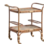
CARLO BAR TROLLEY - 4027A W87 D45 H82