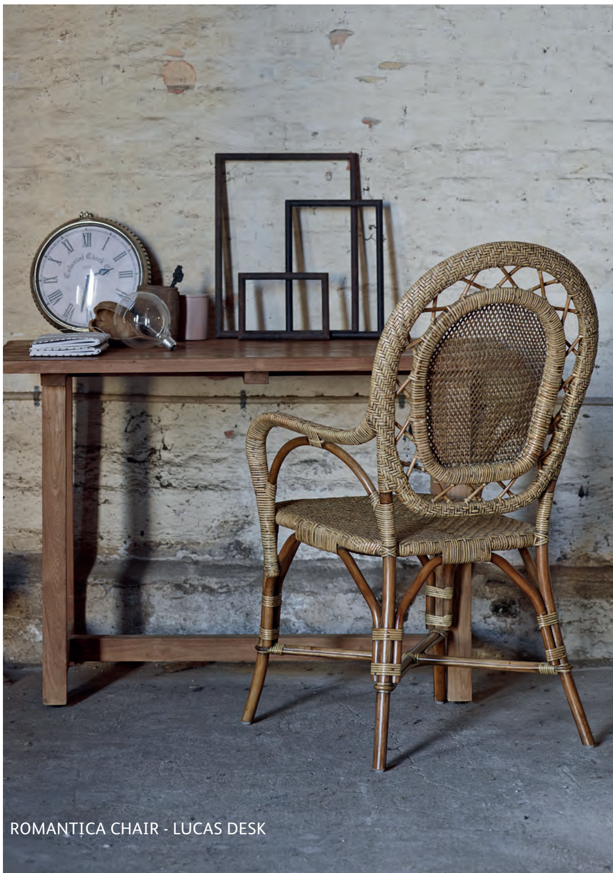
ROMANTICA CHAIR - LUCAS DESK