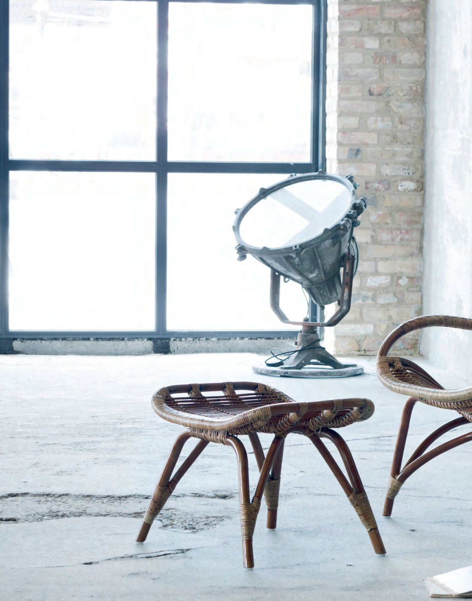
MONET CHAIR - MONET FOOT STOOL - SIDE TABLE