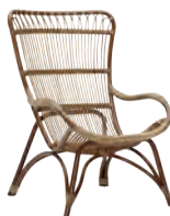
MONET CHAIR - 1082A W67 D81 H98 SH40