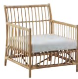
CAROLINE CHAIR - 1026SU W70 D82 H82 SH42