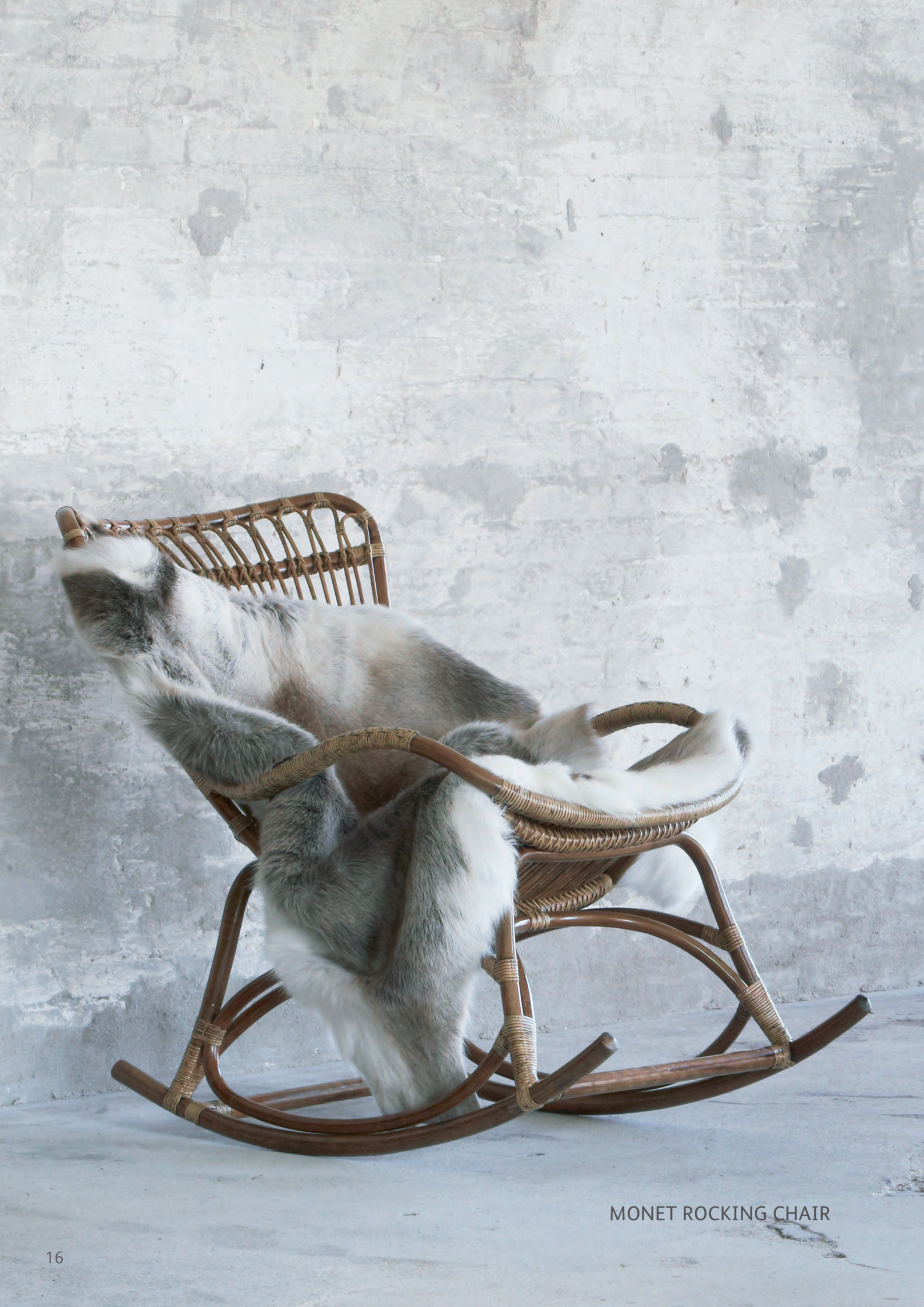
MONET ROCKING CHAIR