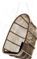
RENOIR SWING - 3080A W75 D68 H113