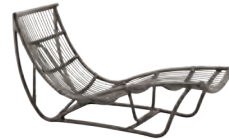
MICHELANGELO DAYBED - 1025T L162 W62 H77