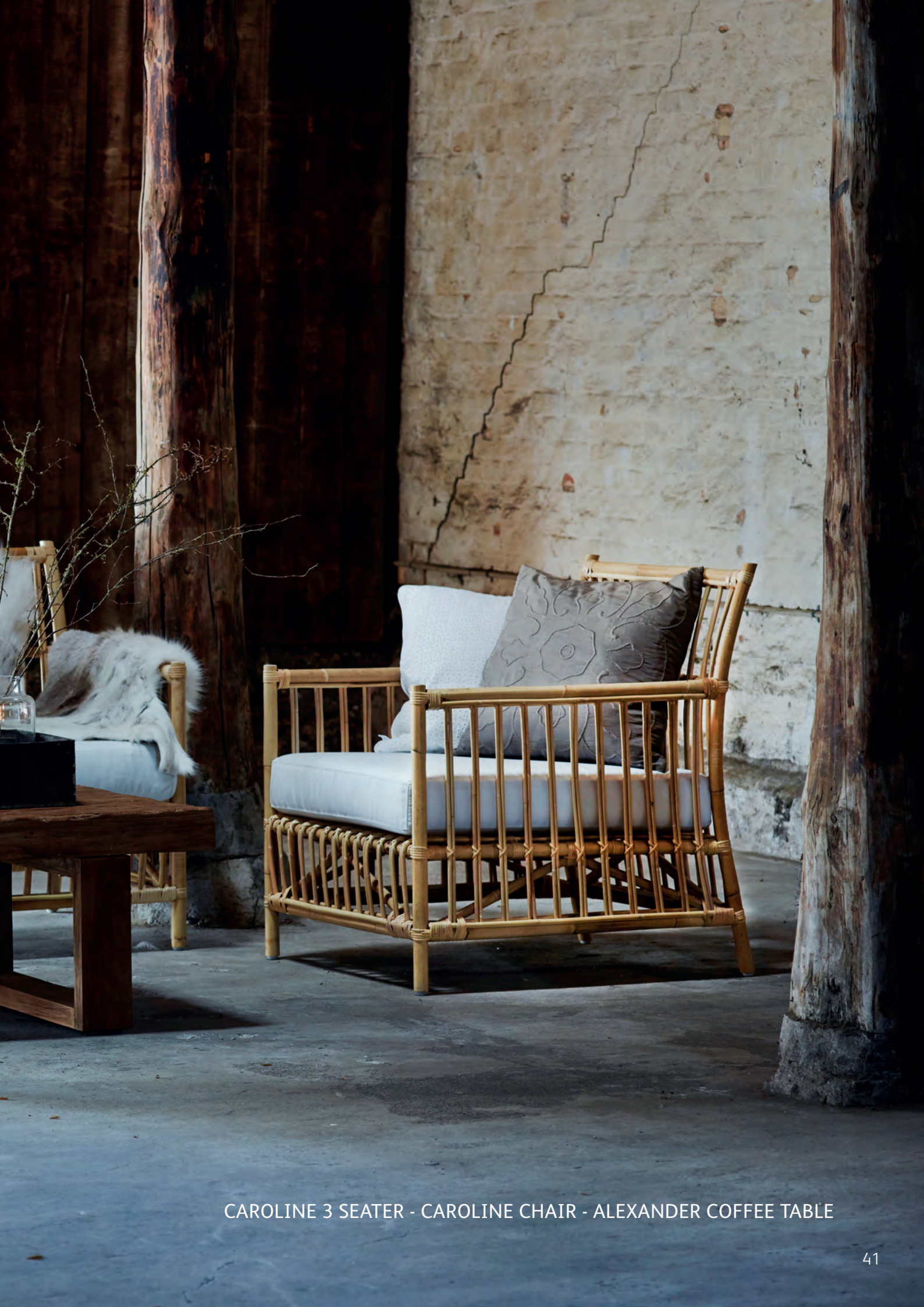
CAROLINE 3 SEATER - CAROLINE CHAIR - ALEXANDER COFFEE TABLE