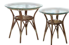
CAFÉ TABLE - SIDE TABLE 4007A Ø80/100 H70 4005A Ø60 H60