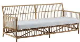
CAROLINE 3-SEATER - 3026SU L197 D82 H82 SH42