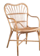
MAGRET CHAIR - 1003SU W53 D40 H88 SH45