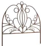
NATALIA HEADBOARD - 5181A W180 H205