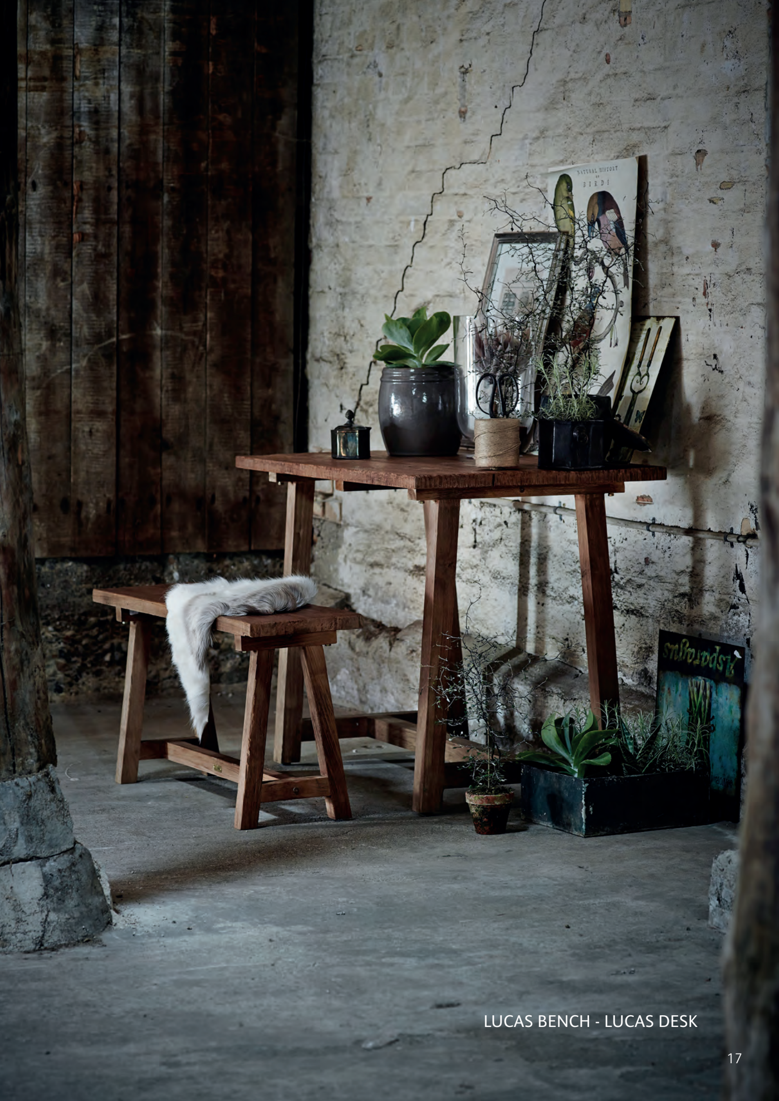
LUCAS BENCH - LUCAS DESK