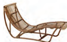
MICHELANGELO DAYBED - 1025A L162 W62 H77