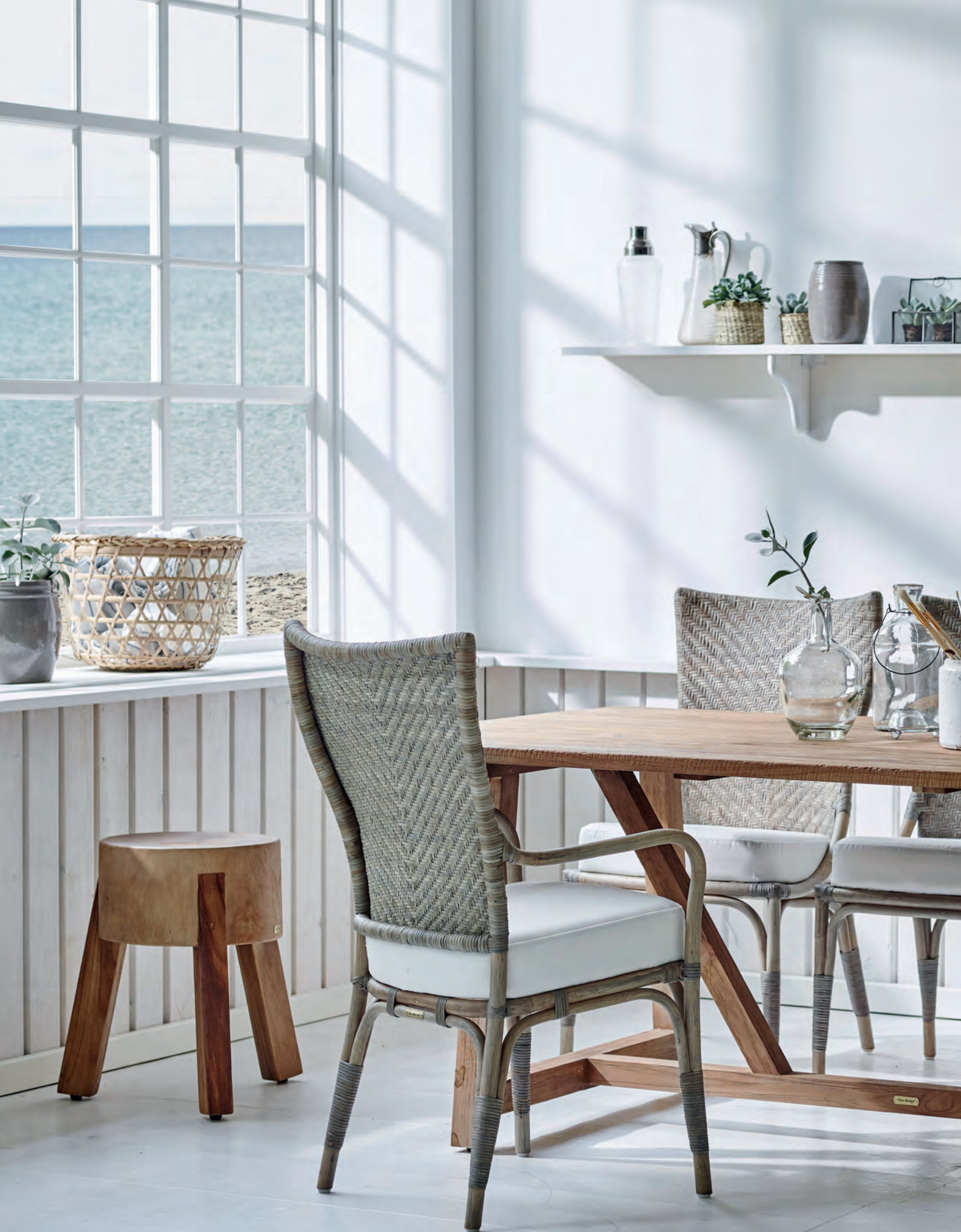
MELODY ARMCHAIR - MELODY CHAIR - LUCAS TABLE - ROGER STOOL