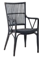
PIANO CHAIR - 1012S W54 D62 H93 SH45 AH65