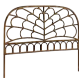
CELIA HEADBOARD - 5183A W138 H180