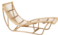
MICHELANGELO DAYBED - 1025U L162 W62 H77