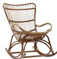
MONET ROCKING CHAIR - 1081A W69 D99 H93 SH45