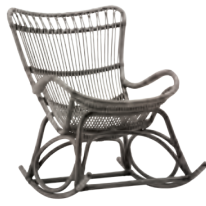
MONET ROCKING CHAIR - 1081T W69 D99 H93 SH45