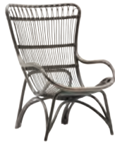
MONET CHAIR - 1082T W67 D81 H98 SH40