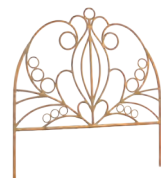
NATALIA HEADBOARD 5181U W205 H138