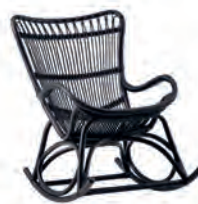
MONET ROCKING CHAIR - 1081S W69 D99 H93 SH45