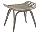
MONET FOOT STOOL - 1084U W53 D42 H40