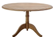
MICHEL TABLE - 9452D Ø120 H72