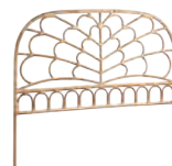
CELIA HEADBOARD 5183U W180 H138