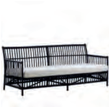
CAROLINE 3-SEATER - 3026S L197 D82 H82 SH42