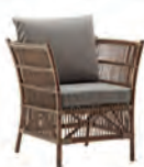
DONATELLO CHAIR - 1086A W73 D72 H75 SH46