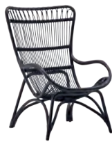
MONET CHAIR - 1082S W67 D81 H98 SH40