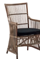
DAVINCI CHAIR - 1005A W56 D54 H99 SH51 AH68