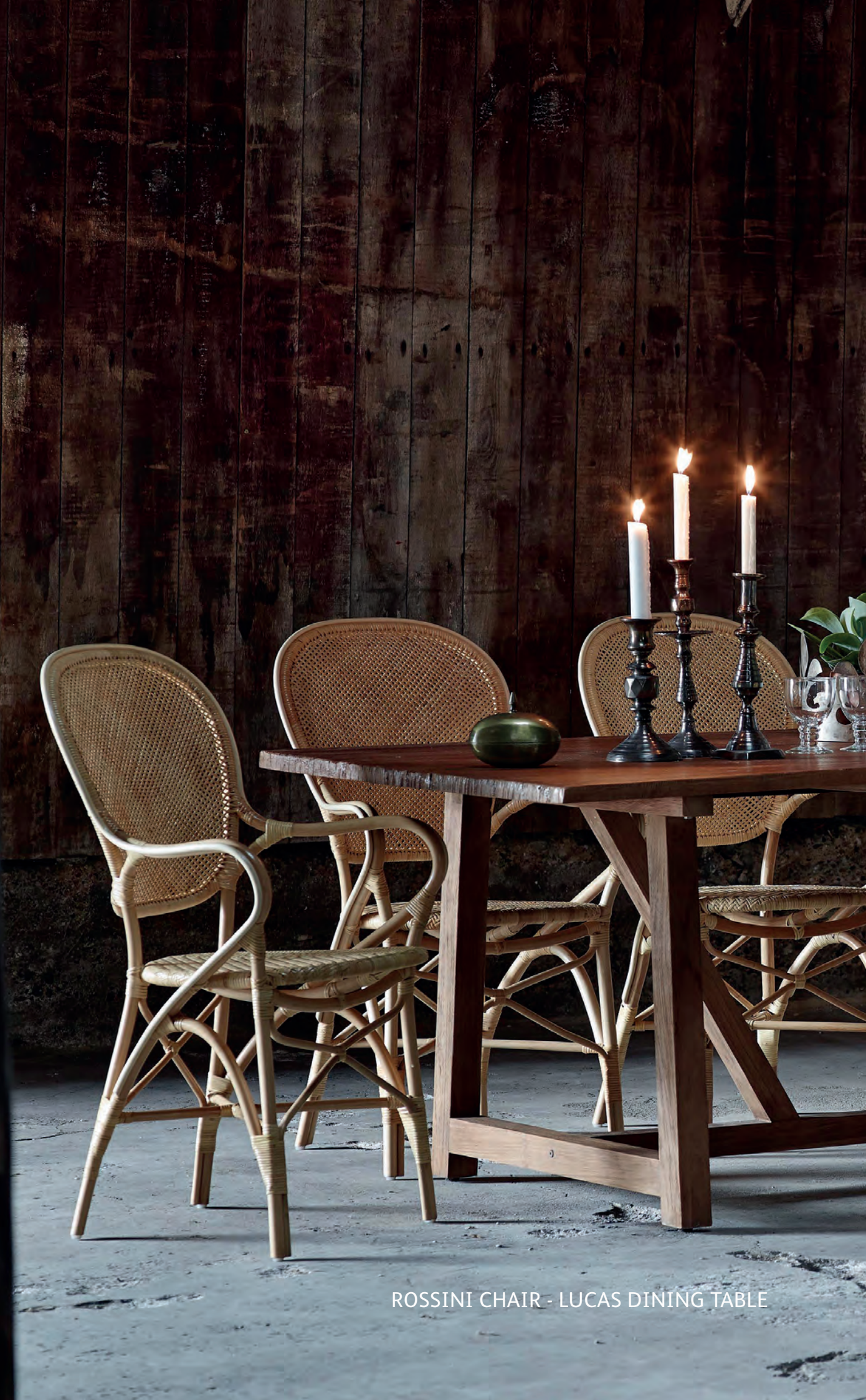
ROSSINI CHAIR - LUCAS DINING TABLE