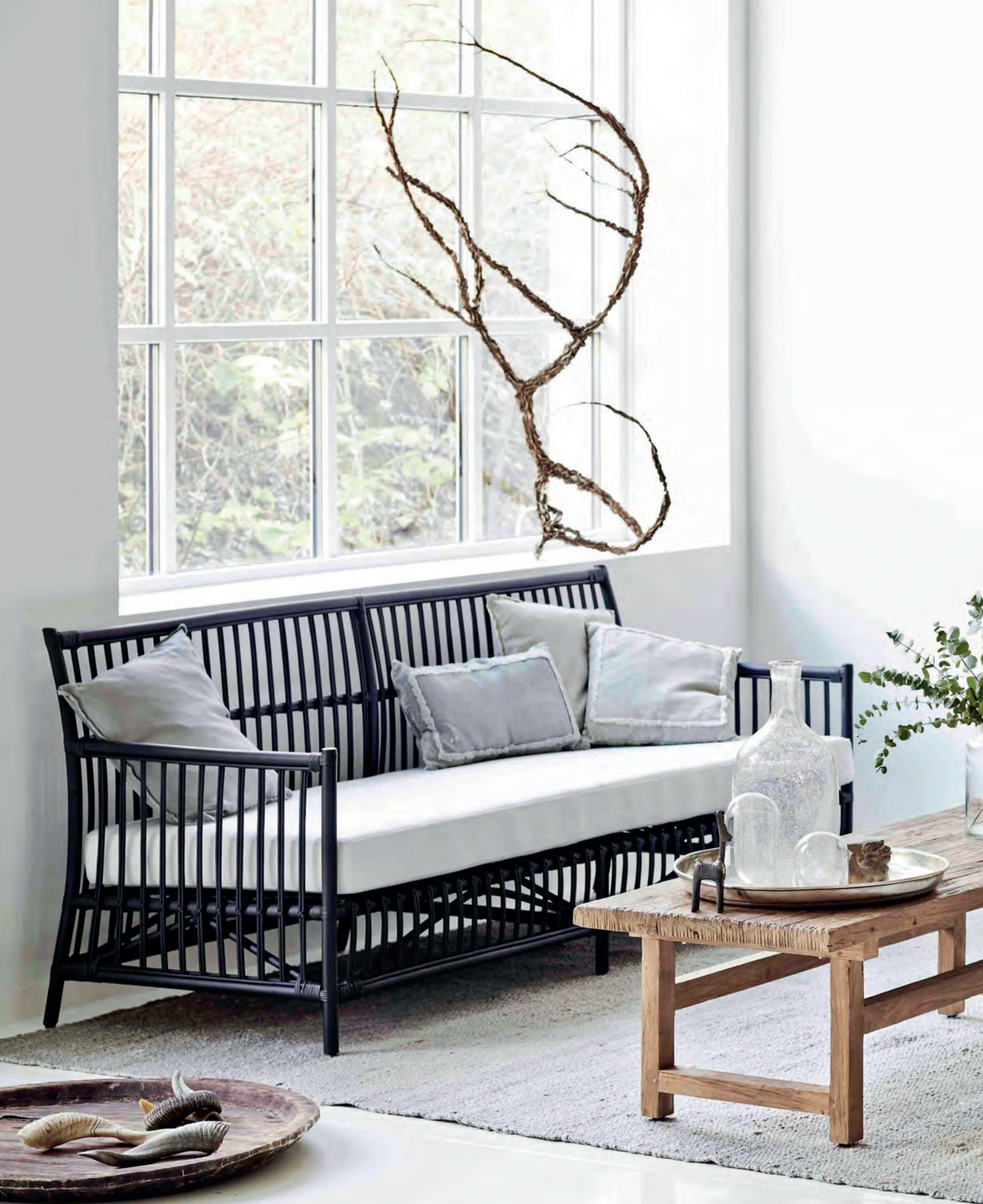
CAROLINE 3 SEATER - CAROLINE CHAIR - AFRED TABLE - SHELLY SHELVES