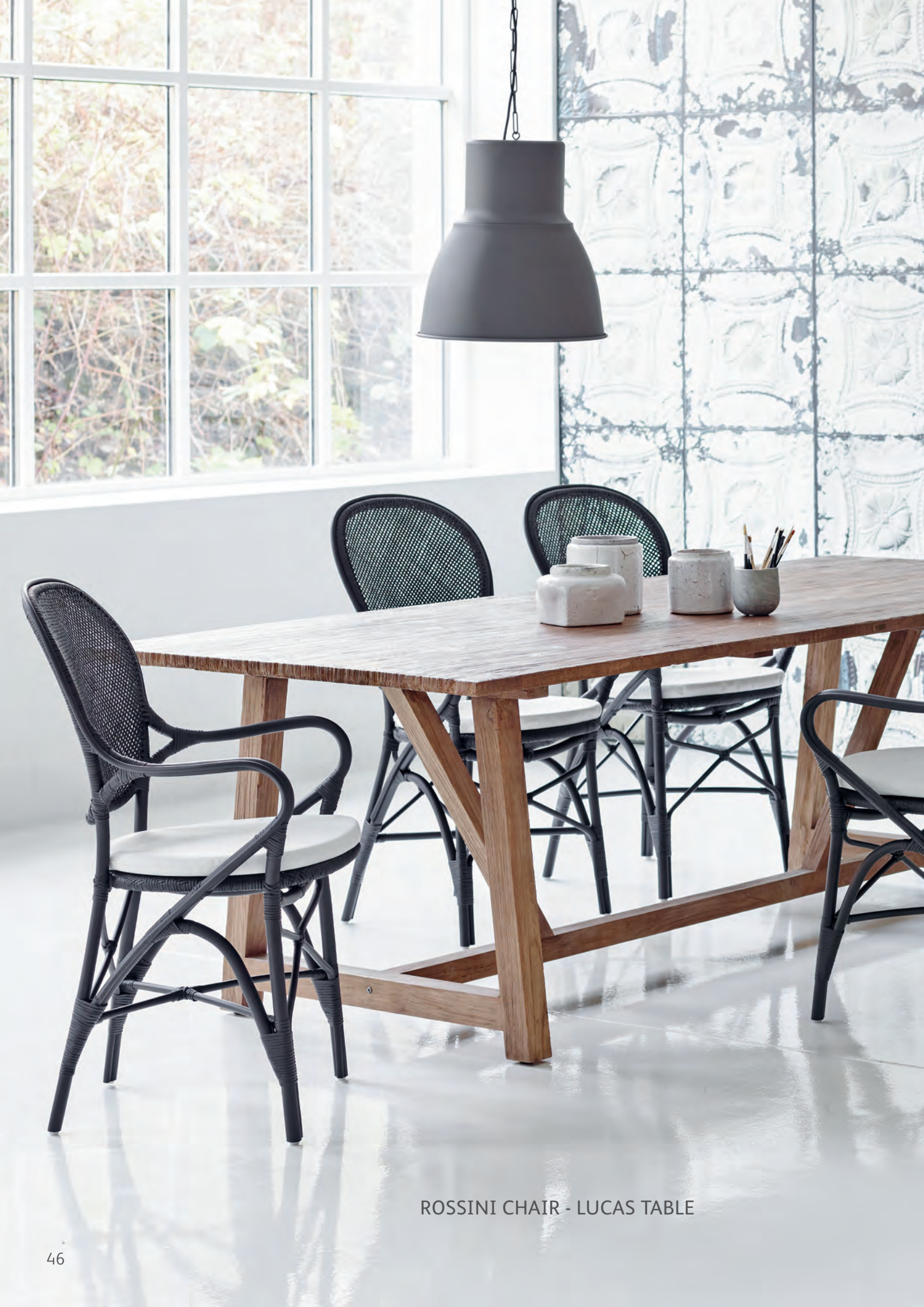
ROSSINI CHAIR - LUCAS TABLE