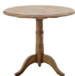
MICHEL TABLE - 9458D Ø80 H72