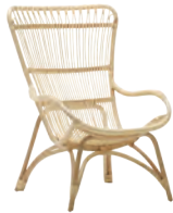
MONET CHAIR - 1082U W67 D81 H98 SH40