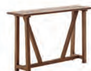
LUCAS CONSOLE - 9471D L140 D40 H90