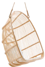
RENOIR SWING - 3080U W75 D68 H113