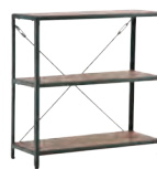
SHELLY SHELVES - 4054D W100 D40 H110