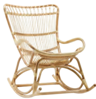
MONET ROCKING CHAIR - 1081U W69 D99 H93 SH45