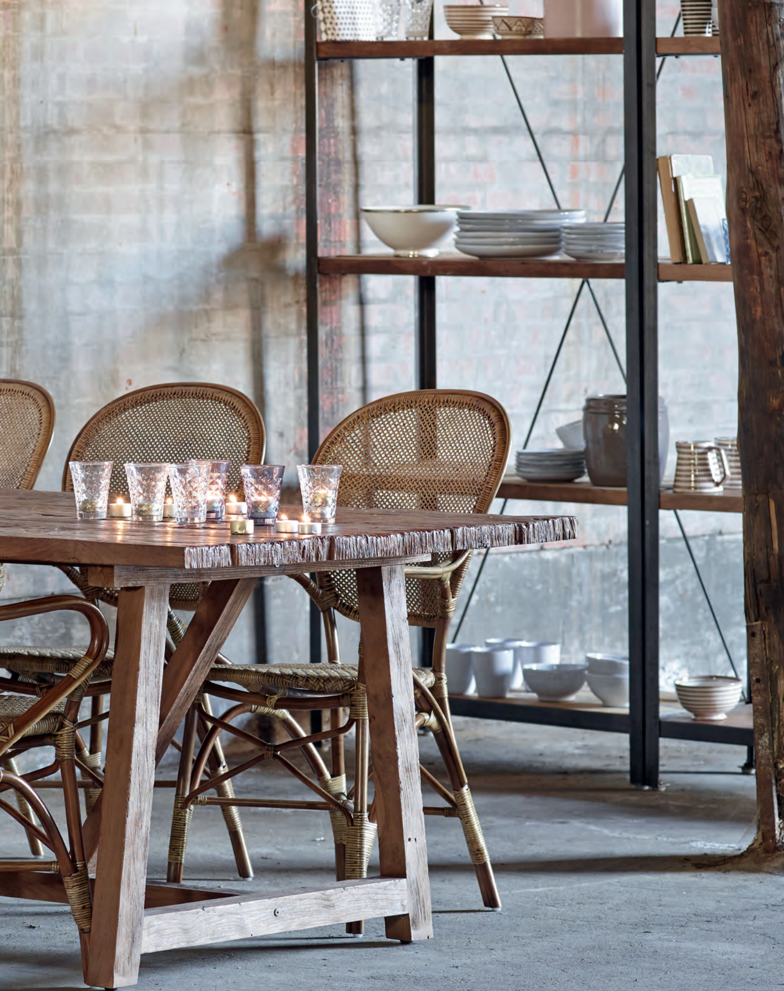
ROSSINI CHAIR - LUCAS DINING TABLE - SHELLY SHELVES